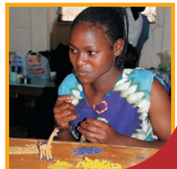
Laboratorio di Perline